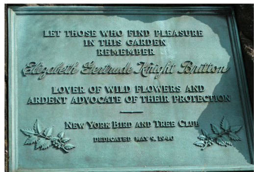
FIG. 1. Plaque dedicated May, 9, 1940, by the New York Bird and Tree Club, to remember Elizabeth Gertrude Knight Britton, "Lover of Wildflowers and Ardent Advocate for their Protection," as photographed in NYBG's Native Plant Garden in 2015.

It was through ambitious floristic and monographic investigations launched during the Britton era that produced the Garden's earliest and most enduring most conservation-relevant scholarship. These titles are discussed in other papers in this volume (e.g., Thomas, 2016, this issue), but mention of some of them is warranted here. With respect to the flora of the Northeastern United States, Britton and Brown (1913) and Britton (1918) are noteworthy. The work on Cactaceae by Britton and Rose (1919–1923) is an outstanding example of an early, significant systematic monograph on a plant group of great conservation concern. Britton and Millspaugh (1920) and Britton and Wilson (1923–1930) exemplify the Garden's early documentation of the Caribbean flora. In the western United States, Curator of the Garden's Herbarium (1908–1931), Per Axel Rydberg, was active in documenting the flora (e.g., Rydberg, 1917), and